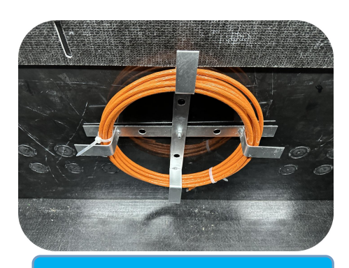
Optional-3 FCST-Cross Cable Rack