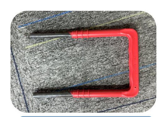
Optional-4 Manhole Ladder