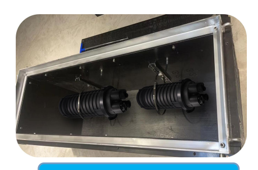
Optional-2 FOSC Fixed Frame