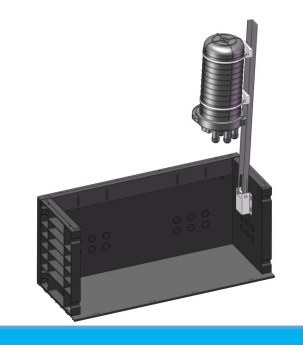
Optional-1 FOSC Fixed Frame